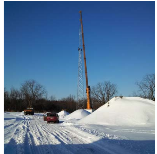
The new microwave tower for Orleans County Emergency Communications was erected at the Clarendon site at Route 31A & Hindsburg Road on 2/19/2014.

The Tolling of the Bell was heard in closing and Amazing Grace was played while the Memorial Candles were extinguished. Special Thanks was given to: Our members for all that you do throughout the year; To our families, friends & community members who give us support at our many functions; To everyone who helped with the banquet set-up; To Holley, Hulberton and Monroe Ambulance for covering our district tonight; and To all of our members serving in our nation's armed forces. Our sincerest thanks, thoughts and prayers are with you. Company Achievements; 1500 Ft 5" LDH; 4 new members; GPS Tracking System for Off-Road Rescue; Equipment for Off-Road Rescue, Survival bags, Life vests, Chain saw. (continued on page 2)